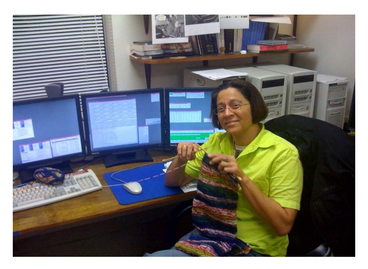
Knitting while operating