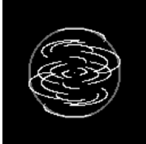
FIGURE 2. Left: UV coverage with optimum ‘3 arm’ 5-telescope configuration. Right: UV coverage with best 3+2 configuration. The outer circle represents a 354 m separation, as in the original CHARA Y.