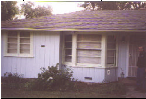
"Blue, like a robin's egg" said Mrs Miniver