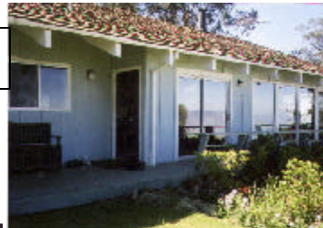
Above and below, the house at Kula on Maui in Hawaii - sigh