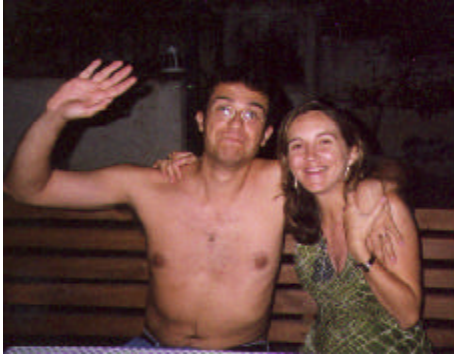
France is for lovers