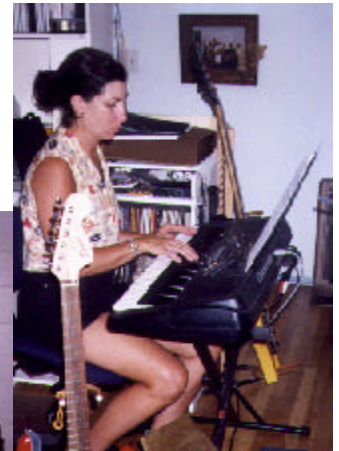
tickling the plastics