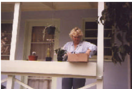
and pretty maids all in a row