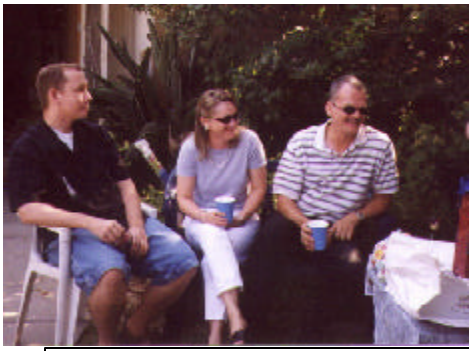
The new and the crew