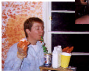
As a matter of fact I think I've got one now...