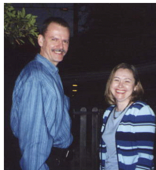
Sturmanns laugh in the face of immigration absurdity