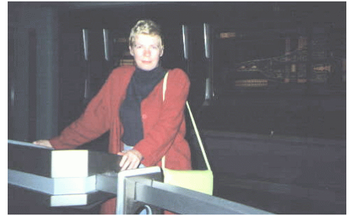
While touring Paramount we meet the real Captain Janeway