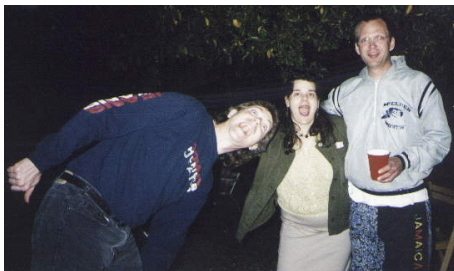
Just a bunch of wild and crazy guys