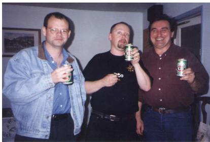
Brute Force and Ignorance