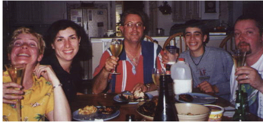
Dixie Chickens and Tennessee Lambs