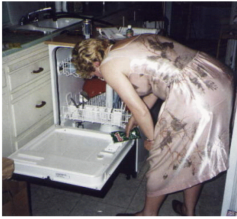
Wife of Bandit mollified