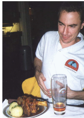
Beast Bests Bloke