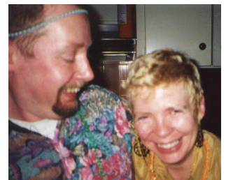
Another wretched day in Southern California